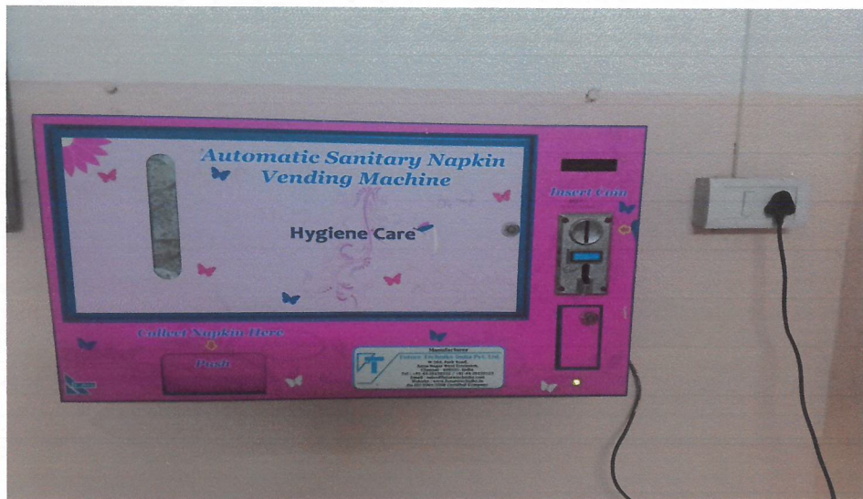
Sanitary Napkin Vending Machine at Girls Washroom