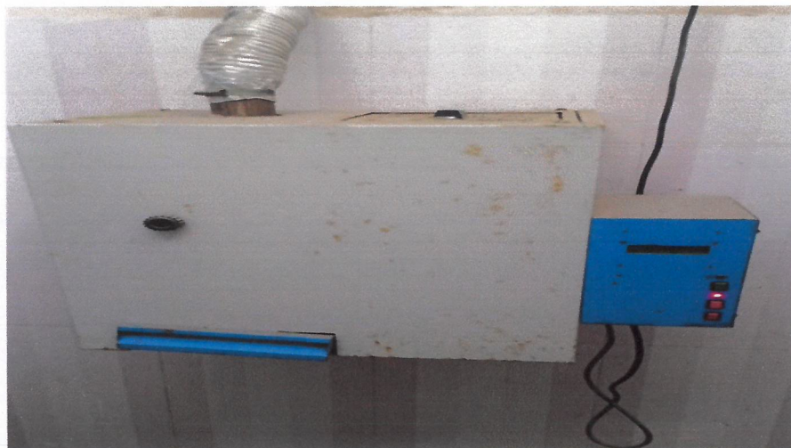
Electrically operated sanitary napkin incinerator at Girls washroom